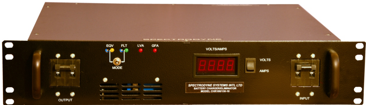
Typical 130V 20 Amp output Charger, 19-inch rack mount, 2RU (3.25" high)